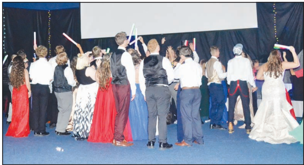
Students danced the night away at their 2019 Prom at the Towns County Recreation and Conference Center.